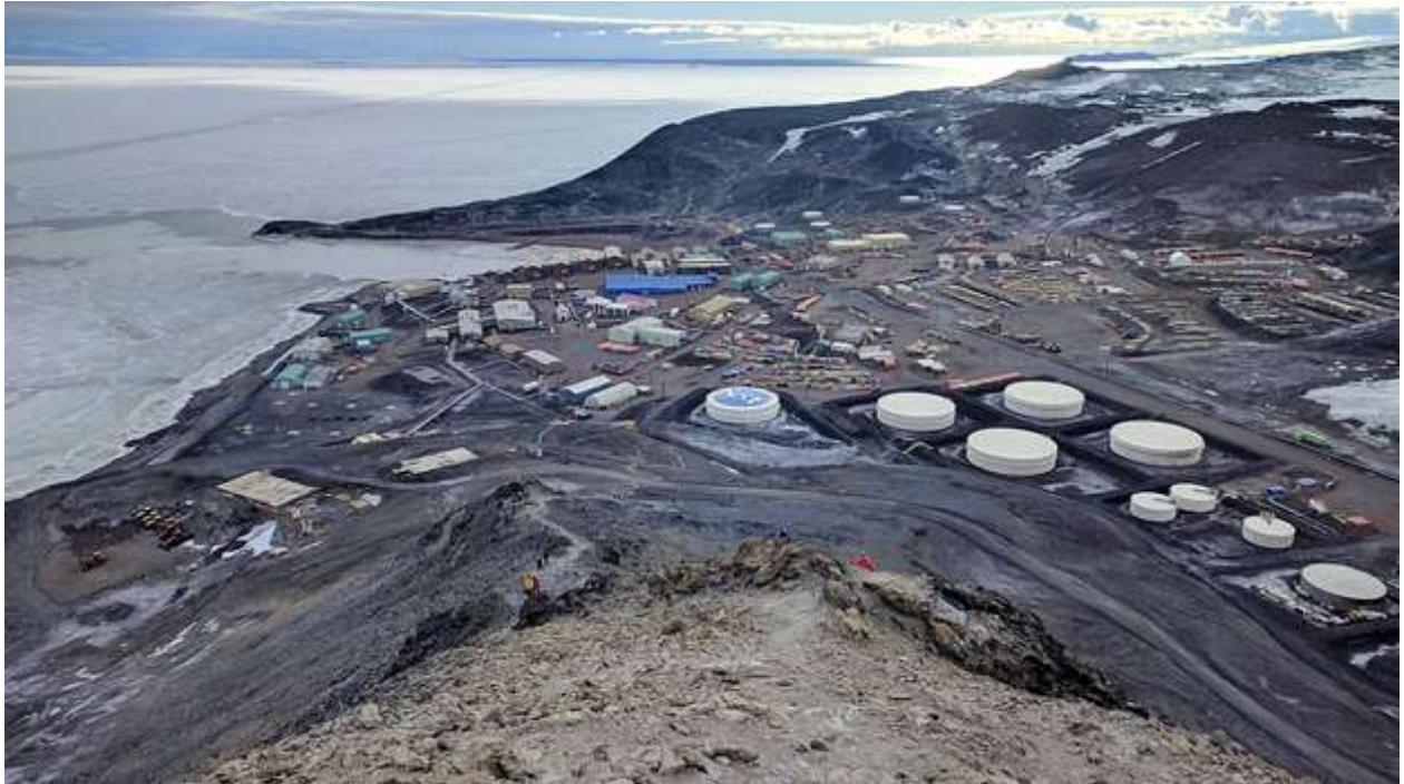
McMurdo Station, Antarctica

In 1962, a nuclear reactor went into operation to supply power for McMurdo Station in Antarctica. While the plant was seen as an alternative to using diesel power, which was difficult to store and transport, it was not without issues. There were periodic coolant leaks and breakdowns. The reactor was shut down in 1972 and replaced with electric generators.