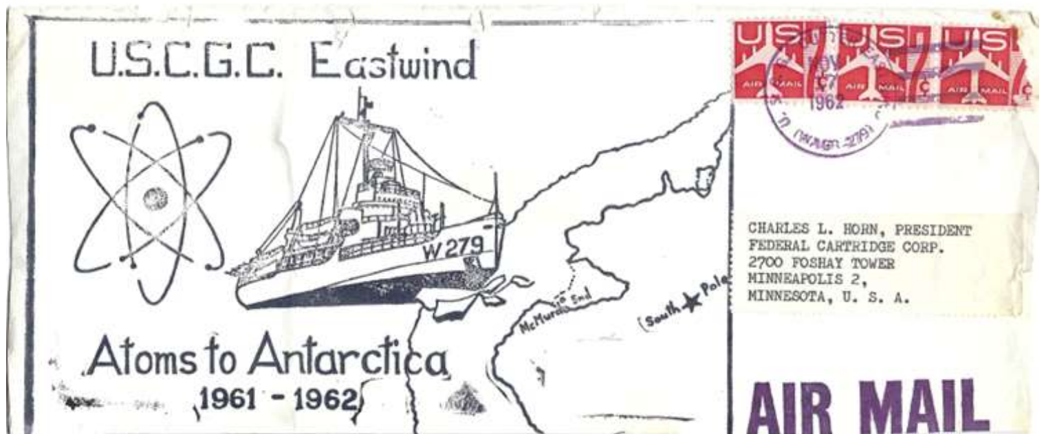
Cancelled 17 November, 1962. USCGC Eastwind (WAGB-279)

In 1962, a nuclear reactor went into operation to supply power for McMurdo Station in Antarctica. While the plant was seen as an alternative to using diesel power, which was difficult to store and transport, it was not without issues. There were periodic coolant leaks and breakdowns. The reactor was shut down in 1972 and replaced with electric generators.