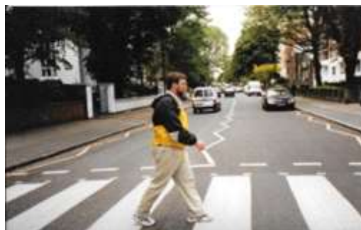
May 14, 2002