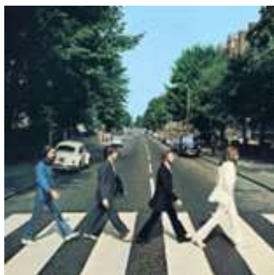
August 8, 1969

On August 8, 1969, the Beatles photo shoot at the crosswalk at Abby Road in northwest London formed the cover of their fabulous album Abbey Road . I loved that album, produced at the studio adjacent to the crosswalk. Growing up in the 1960s, we always looked forward to the next album the Beatles created, and the Abbey Road album didn't disappoint.