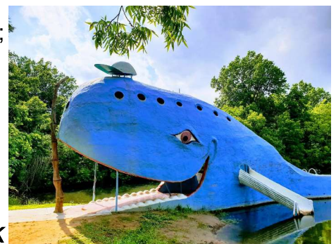
The Blue Whale of Catoosa, OK

Beverly Hills City Hall, built in 1932 in Beverly Hills, California.